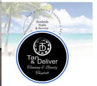
Tan & Deliver Tanning & Beauty Twydall